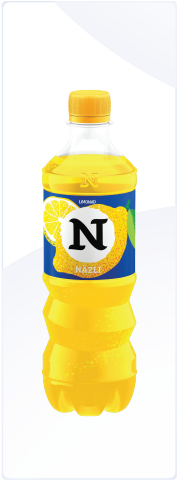
NÄZLI CARBONATED DRINK "LEMONADE"