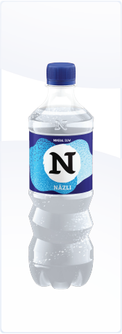
NÄZLI "MINERAL WATER"