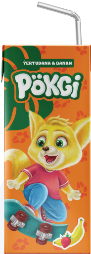
POKGI JUICE "BANANA- STRAWBERRY"