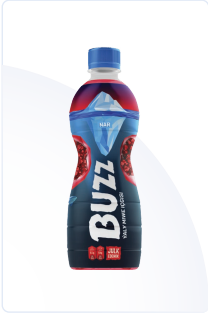
BUZZ JUICE DRINK "POMEGRANATE"