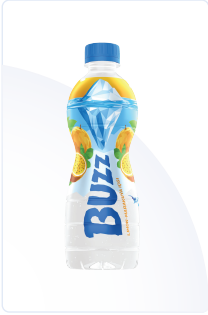
BUZZ FLAVORED WATER "LEMON- MARACUJA"