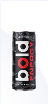
BOLD ENERGY BLACK EDITION 250ML NEW PRODUCT