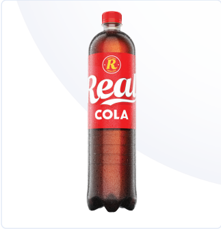
REAL COLA NEW PRODUCT