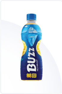
BUZZ GREEN TEA "LEMON"