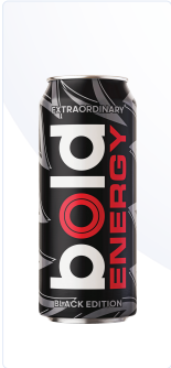
BOLD ENERGY BLACK EDITION 500ML NEW PRODUCT