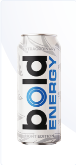
BOLD ENERGY LIGHT EDITION 500ML NEW PRODUCT