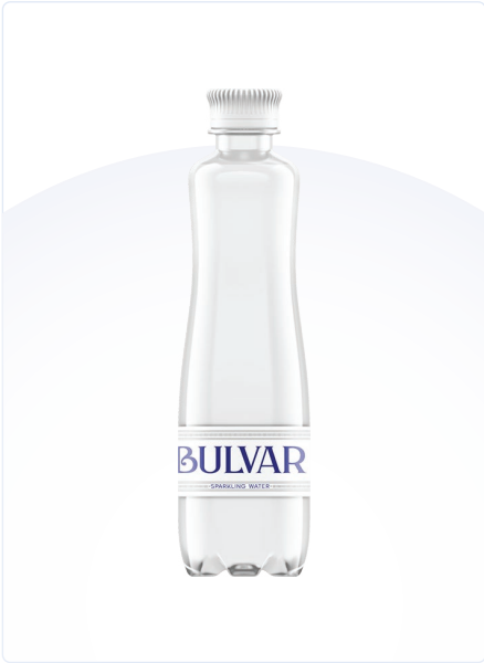
BULVAR SPARKLING WATER