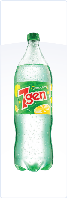
7GEN CARBONATED DRINK "LEMON&LIME"