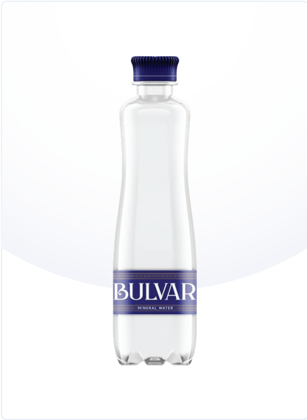
BULVAR MINERAL WATER