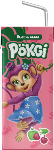
POKGI JUICE "CHERRY-APPLE"