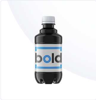
BOLD LIGHT EDITION