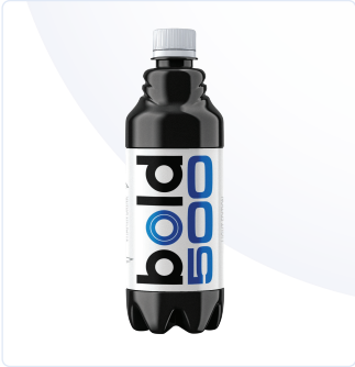
BOLD 500 LIGHT EDITION NEW PRODUCT