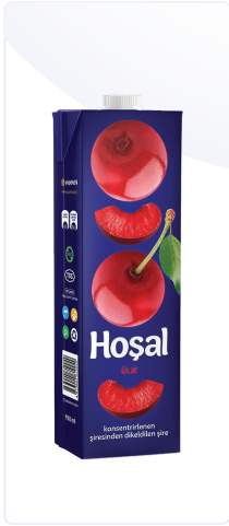
HOŞAL JUICE "CHERRY"