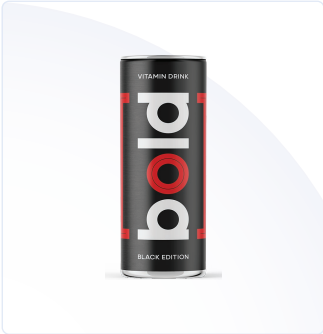
BOLD BLACK EDITION