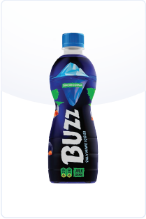
BUZZ JUICE DRINK "BLACK CURRANT"