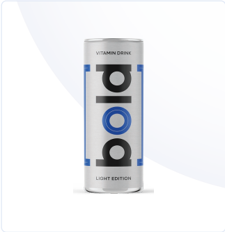
BOLD LIGHT EDITION