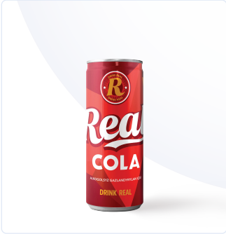
REAL COLA 330 ML NEW PRODUCT