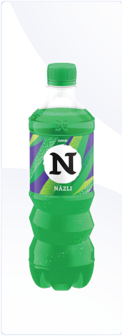
NÄZLI CARBONATED DRINK "TARRAGON"