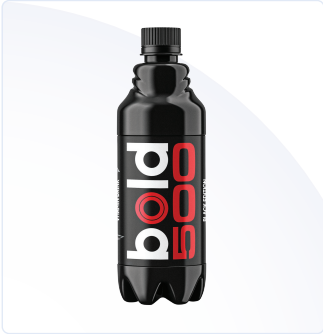
BOLD 500 BLACK EDITION NEW PRODUCT