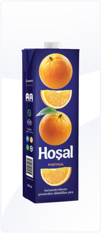
HOŞAL JUICE "ORANGE"