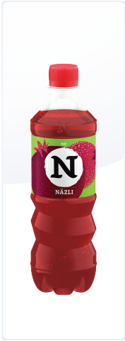
NÄZLI CARBONATED DRINK "POMEGRANATE"