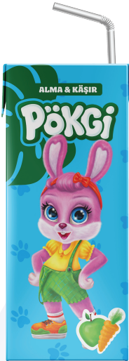
POKGI JUICE "CARROT-APPLE"