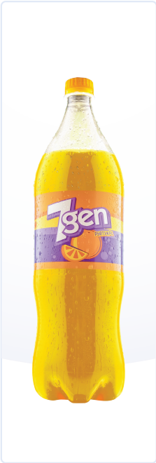
7GEN CARBONATED DRINK "ORANGE"