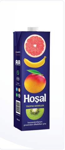
HOŞAL JUICE "MULTIFRUIT"