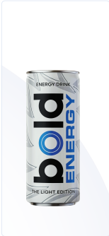
BOLD ENERGY LIGHT EDITION 250ML NEW PRODUCT