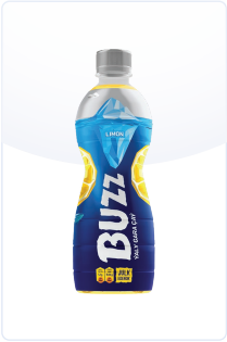
BUZZ BLACK TEA "LEMON"