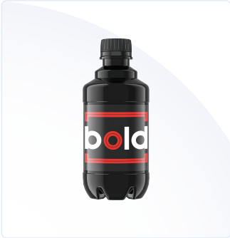
BOLD BLACK EDITION