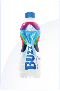
BUZZ FLAVORED WATER "ICED BERRY"