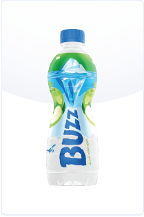
BUZZ FLAVORED WATER "APPLE- KIWI"