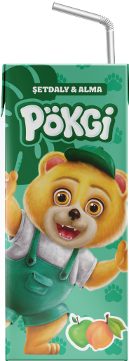
POKGI JUICE "PEACH-APPLE"