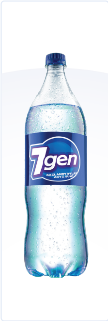
7GEN CARBONATED DRINK "MINERAL"