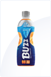
BUZZ BLACK TEA "PEACH"