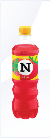
NÄZLI CARBONATED DRINK "STRAWBERRY"