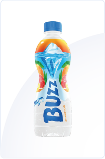
BUZZ FLAVORED WATER "CITRUS"