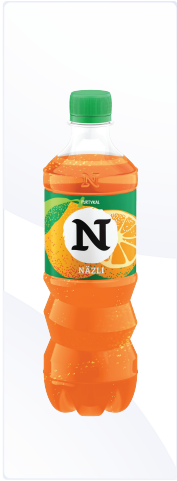
NÄZLI CARBONATED DRINK "ORANGE"