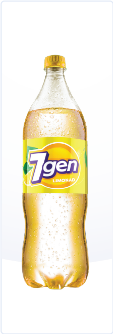
7GEN CARBONATED DRINK "LEMONADE"