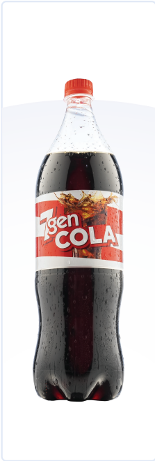
7GEN CARBONATED DRINK "COLA"