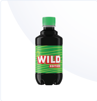
BOLD WILD EDITION