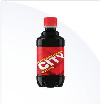
BOLD CITY EDITION