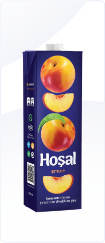
HOŞAL JUICE "PEACH"