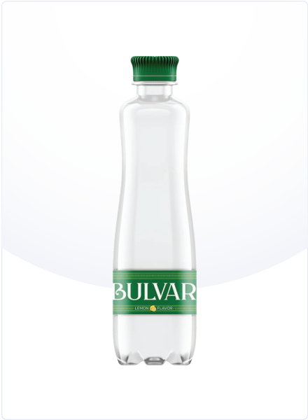
BULVAR LEMON CARBONATED WATER