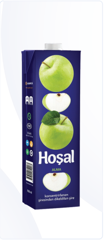
HOŞAL JUICE "APPLE"