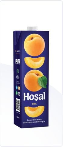
HOŞAL JUICE "APRICOT"